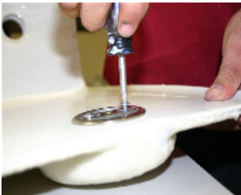
Using Phillips head screw driver tighten screws evenly