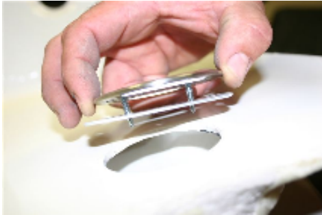
Loosen 2 screws from overflow mounting bracket