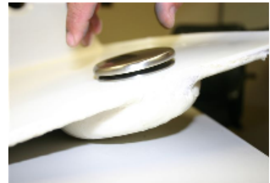
Screw in overflow cover leaving approx. 3/16 gap from tub wall to overflow plate