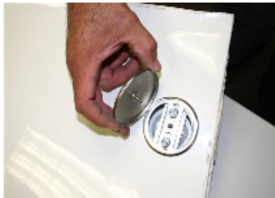
Insure that center holes align. Place small amount of silicone to overflow face plate stud