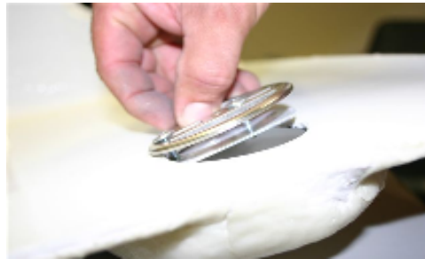
Install overflow backing plate on angle on side at a time