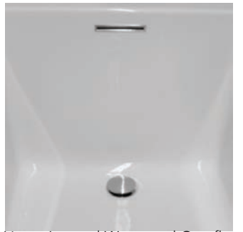
Linear Integral Waste and Overflow