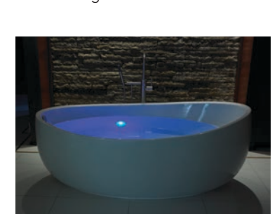
Chromatherapy-LED Lighting System