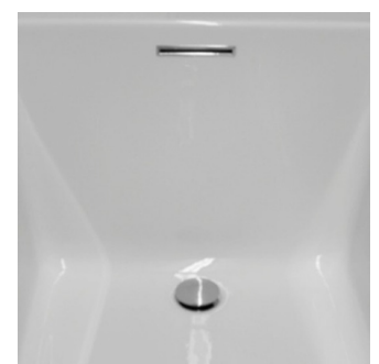
Linear Integral Waste and Overflow