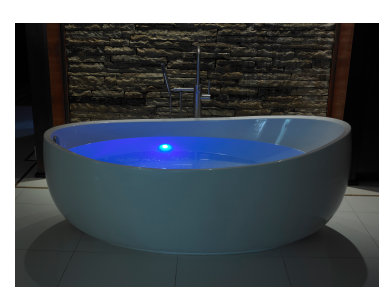
Chromatherapy-LED Lighting System