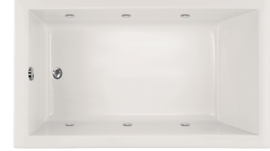
*Tub must be set in mortar base*

All specifications and options subject to change without notice please contact a Hydro Systems representative for more information. Certain options or altering the pump/blower location may cause the pump/blower to extend beyond the tub decking. For cutout dimensions wait for unit to arrive. All specifications subject to change without notice.