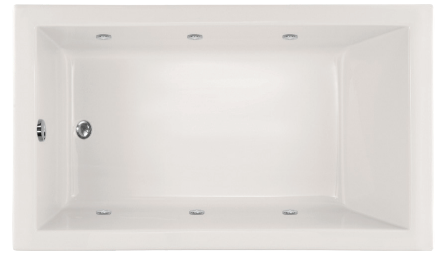
*Tub must be set in mortar base*