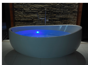
Chromatherapy-LED Lighting System