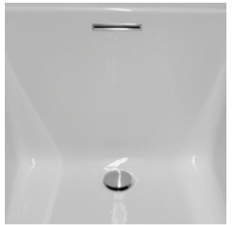
Linear Integral Waste and Overflow