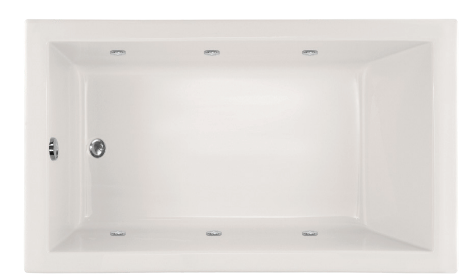
*Tub must be set in mortar base*

All specifications and options subject to change without notice please contact a Hydro Systems representative for more information. Certain options or altering the pump/blower location may cause the pump/blower to extend beyond the tub decking. For cutout dimensions wait for unit to arrive. All specifications subject to change without notice.