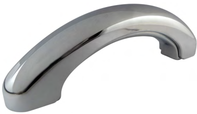
Standard Grab Bar