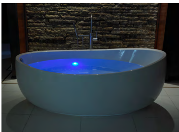
Chromatherapy-LED Lighting System