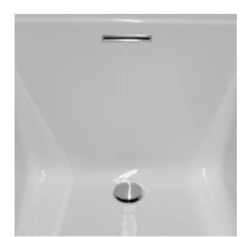
Linear Integral Waste and Overflow