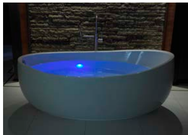
Chromatherapy-LED Lighting System