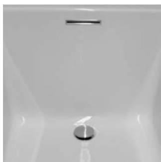
Linear Integral Waste and Overflow