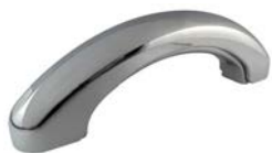
Standard Grab Bar