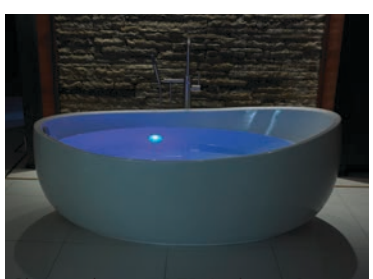
Chromatherapy-LED Lighting System