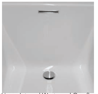
Linear Integral Waste and Overflow