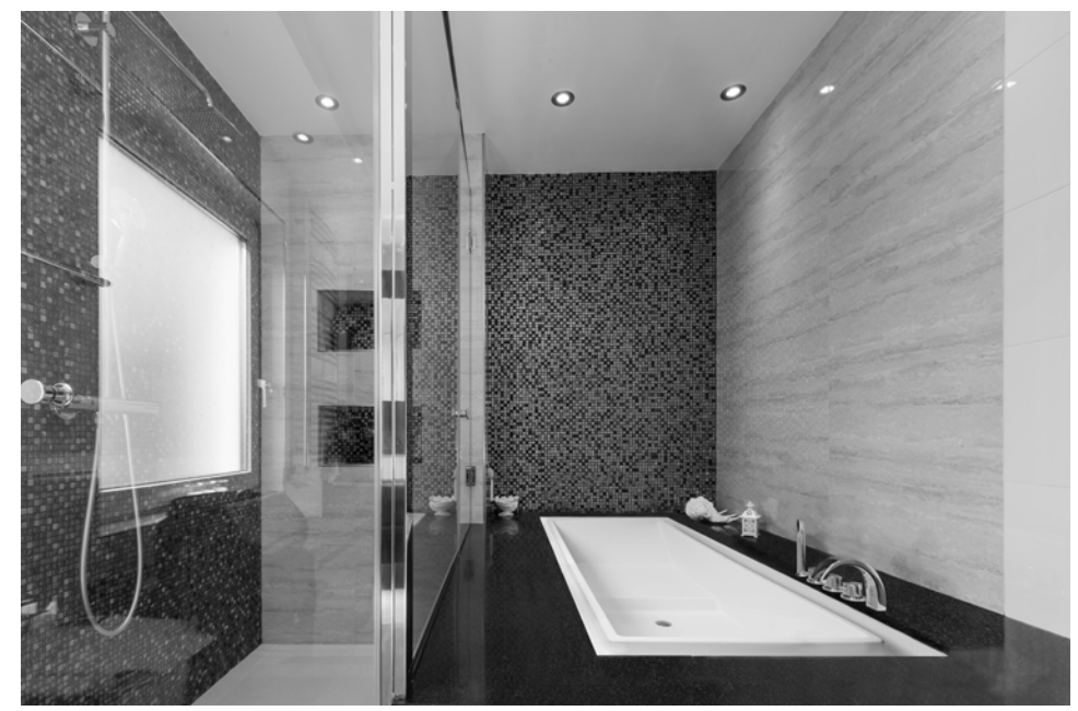
OPTIONS (more information available on our website)