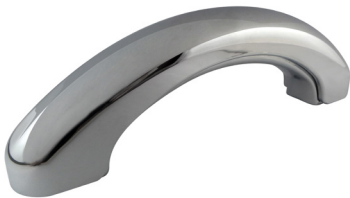
Standard Grab Bar