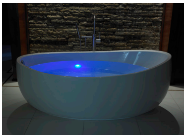
Chromatherapy-LED Lighting System