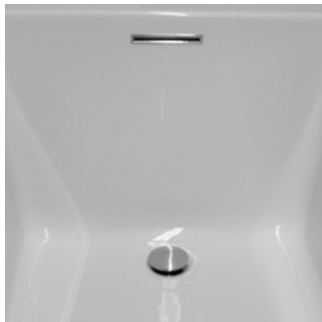
Linear Integral Waste and Overflow